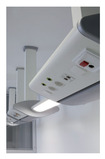
R&D&i Design Tooling Productive plant Quality

At Normagrup, we solved this by creating divisions that function as experts in their area. We also have common departments that work for everyone and give us cohesion.